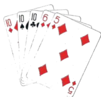
Three of a Kind