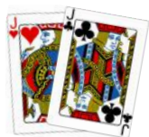
Jack or Better