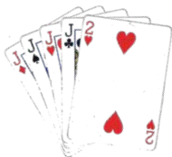
Four of a Kind